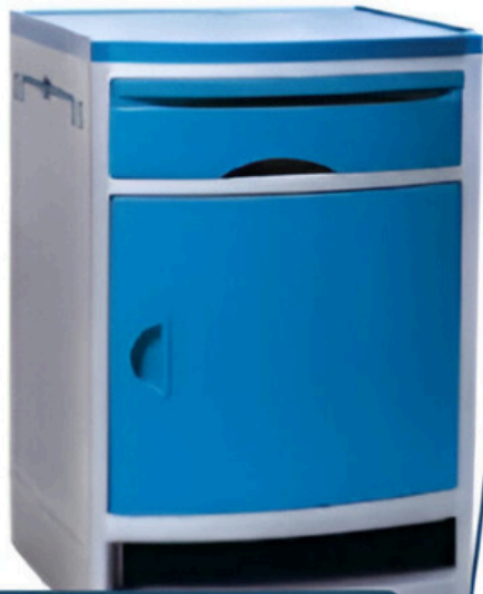
Bed side Locker