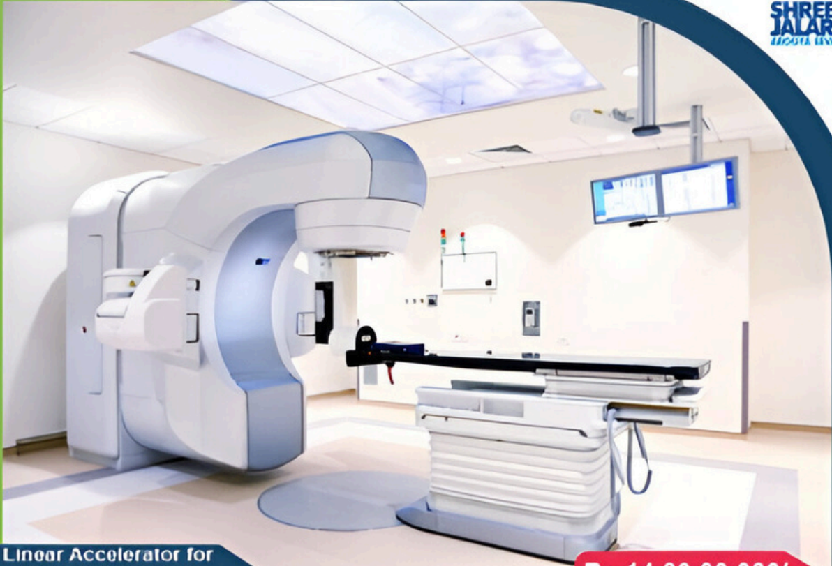
Linear Accelerator for Cancer Treatment