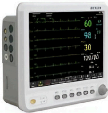
Multiparamonitor 5 Paramonitor Rs.70,000/-