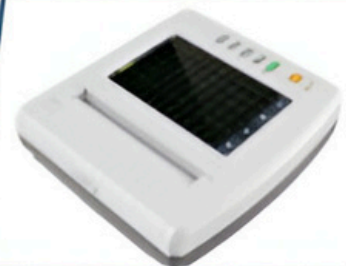
ECG Machine 12 Channel Rs.58,000/-