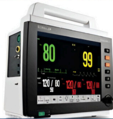
Multiparamonitor 3 Paramonitor Rs.35,000/-