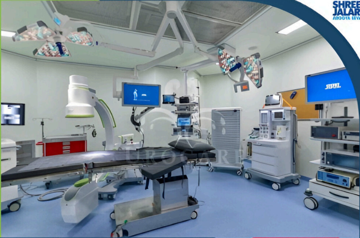
MODULAR OPERATION THEATRE WITH ANASTASIA TROLLEY