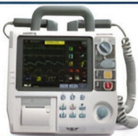
Defibrillator Machine Rs.95,000/-