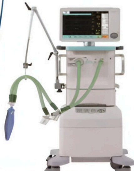
Ventilator Neonatal to Pediatric for Adult