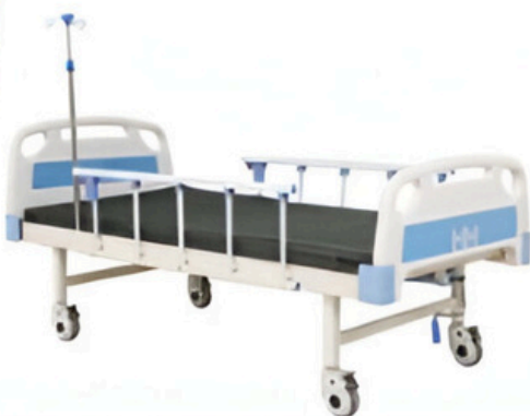
Bed with Mattress Rs.17,500/-