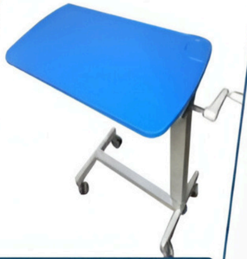
Cardiac Table With ABS