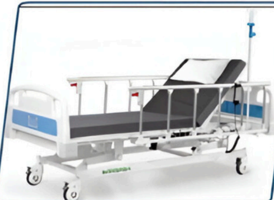
ICU Bed with Mattress Rs.65,000/-