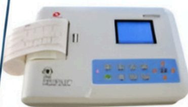
ECG Machine 3 Channel Rs.28,000/-