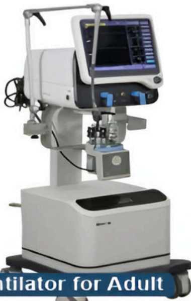
Ventilator for Adult