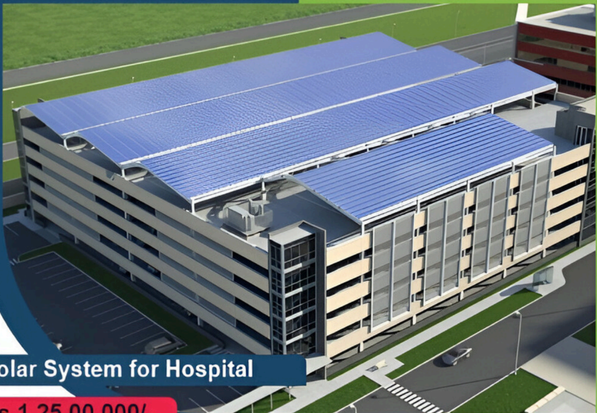
Solar System for Hospital