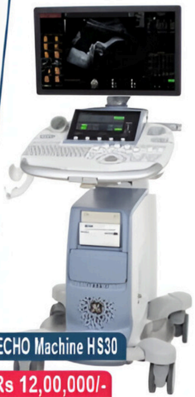
ECHO Machine HS30